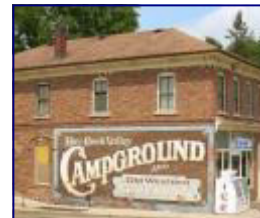
March 20, 11:30 am

coming and can make a reservation. Questions? Contact Bonnie Voth at 651-388-7443