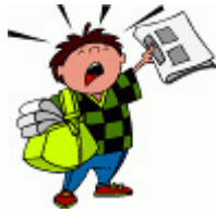
News from 1/29