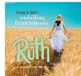
Begins January 8th