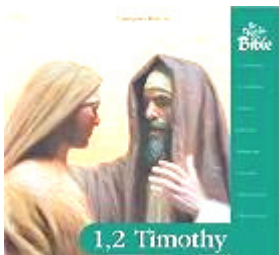
Begins January 5th

Timothy was a young pastor and an important member of the apostle Paul's missionary team, accompanying him on his second and third missionary journeys. He also was his representative whom