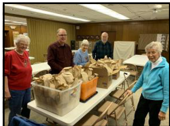
Thanks volunteers, for filling all those candy bags.

Our calendar is finalized and games are listed on the next page. Our first game is January 9 vs Zumbrota @ Mazeppa Middle School. Our first home game is January 17 @ Sunnyside. Come cheer on our Tigers!