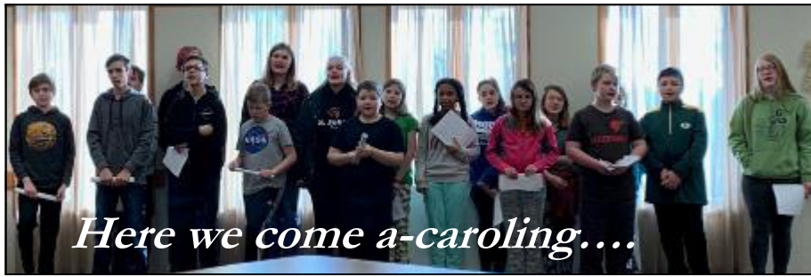
Here we come a-caroling....