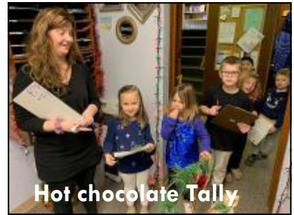
Hot chocolate Tally