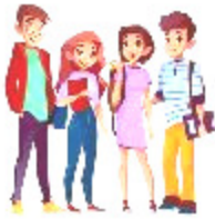
YPS Gr. 7-1 st year of college