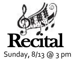
Sunday, 8/13 @ 3 pm