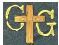
Sunday, 8/19 @10 am